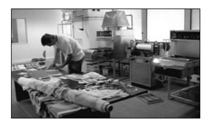
Figure 4. Digital Technological Center (DTC)

The DTC, Digital Technological Center is a recent realization by Ciba Specialty Chemicals and Reggiani Macchine S.p.A., aimed at furthering industrial digital printing. Established on March 01, 2004 in Grassobbio (Bergamo) c/o Reggiani Macchine S.p.A., the DTC is an independent organisation and the result of a common project between the two partners. This modern structure is dedicated to the study and research of the digital workflow, production process and the pre / post treatment of digital printing.