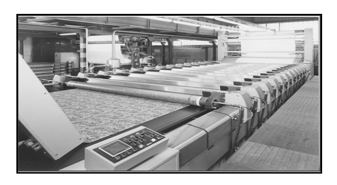
Figure 1. Reggiani Macchine S.p.A. rotary screen printing machine

Reggiani Macchine S.p.A. is a world leader building machines exclusively in the textile sector for the last 50 years. This extensive experience in the textile sector makes Reggiani Macchine S.p.A. a trustworthy partner to the most important textile manufacturers at a world class level.